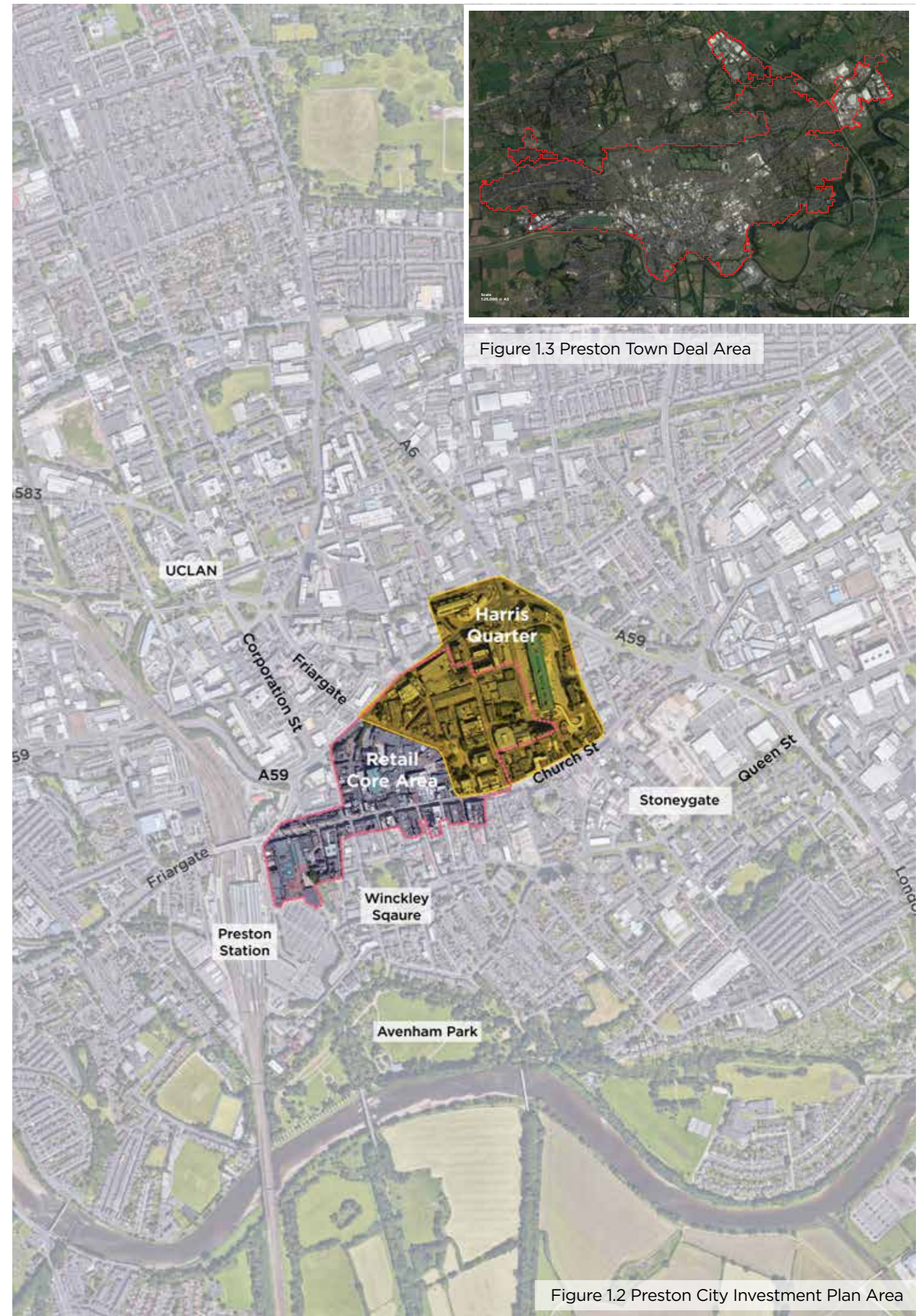
Figure 1.3 Preston Town Deal Area